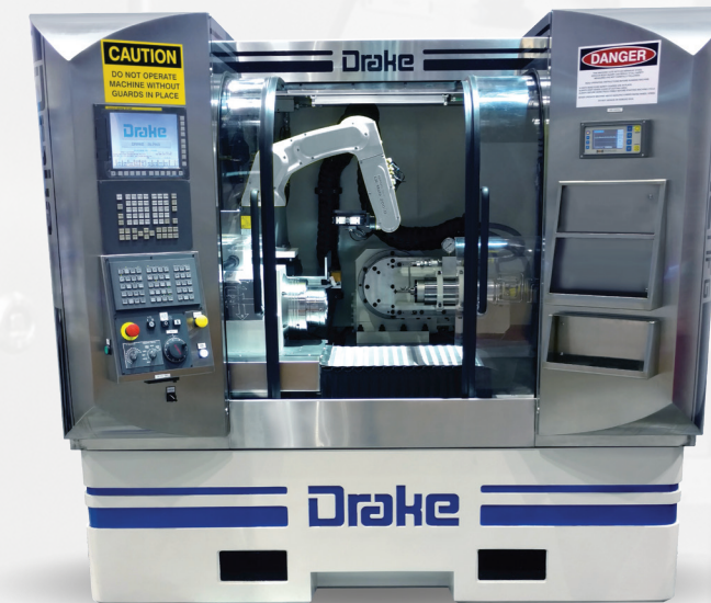
▲ Drake GS:TI Internal Thread Grinder with Robot Load