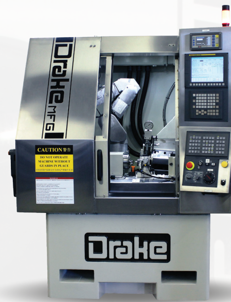
Drake GS:TEM Mini External Thread Grinder

Drake's advanced thread grinding technology is powered by PartSmart™ software and optimizes grinding processes. All Drake machines are fully programmed and include special applications that ensure form and accuracy. Drake's industry knowledge and process expertise, paired with continual investment in research and development, provide our customers with a competitive advantage.